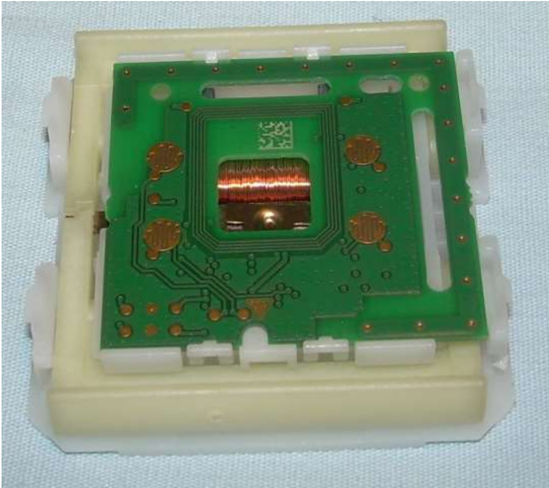
Photograph 2 – Back View of the Device