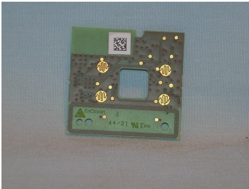
Photograph 1 – Front View of the Device