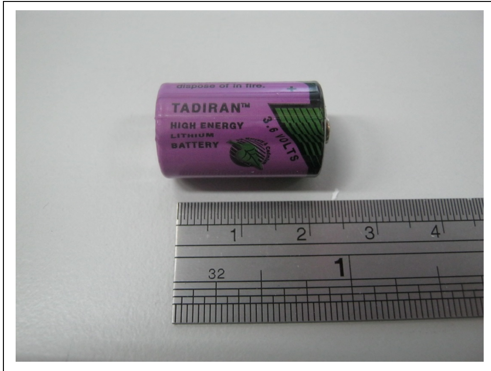
Photograph A4-1: Example of battery used for test

Test on EnOcean GmbH PTM 215B to 47 CFR § 15.249 and RSS-210 Issue 9 (Amendment), Annex B.10