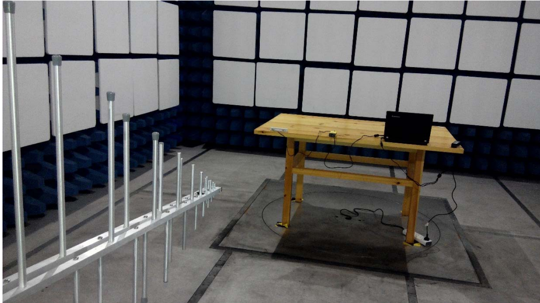
30MHz~1GHz SD Card Test Mode