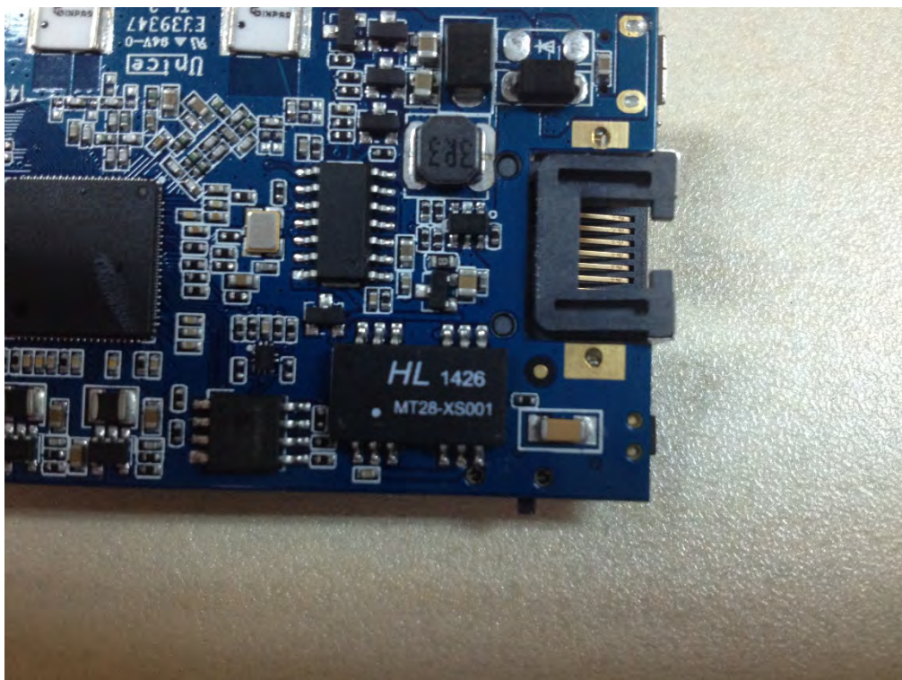
MAIN BOARD TOP VIEW 3