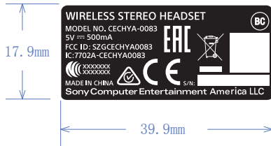
Spark O2 Headset Label