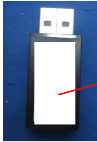
Spark O2 Dongle Label