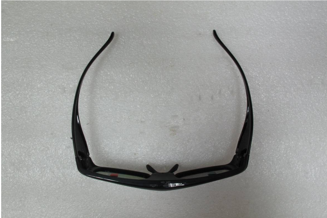
Side View of EUT – 4 (TY-ER3D4MU)