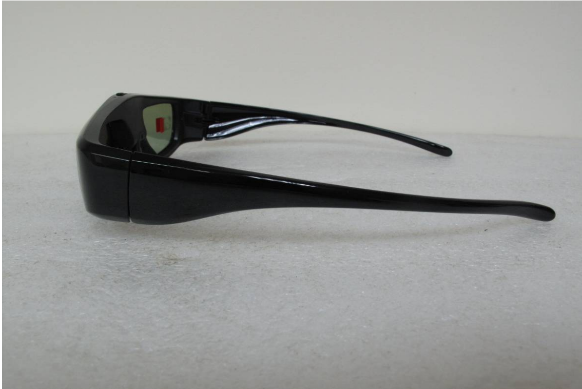
Side View of EUT - 2 (TY-ER3D4MU)