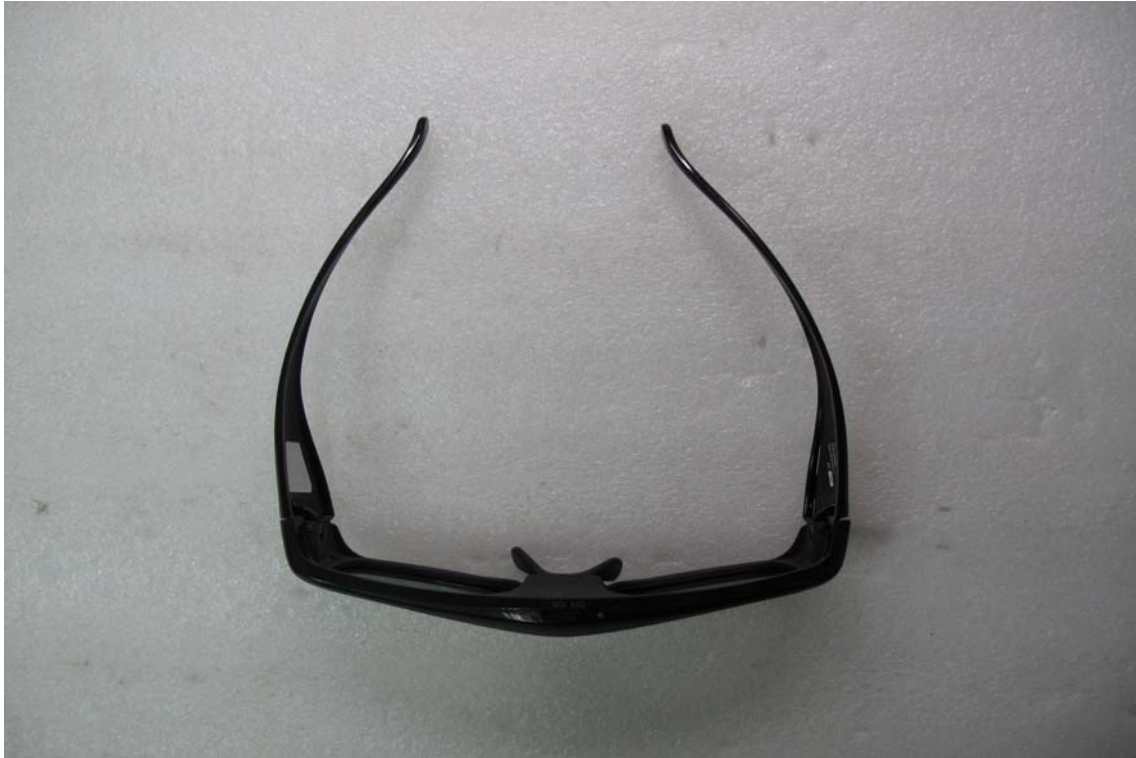
Side View of EUT – 4 (TY-ER3D4SU)