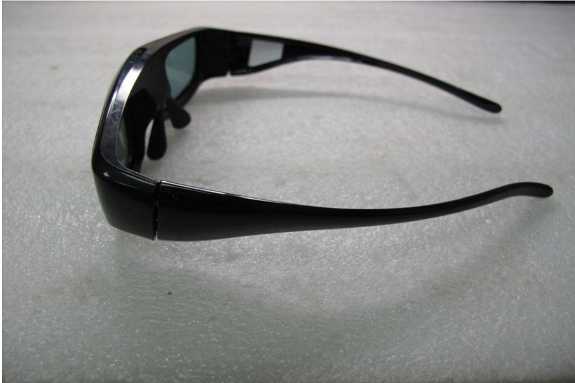
Side View of EUT - 2 (TY-ER3D4SU)