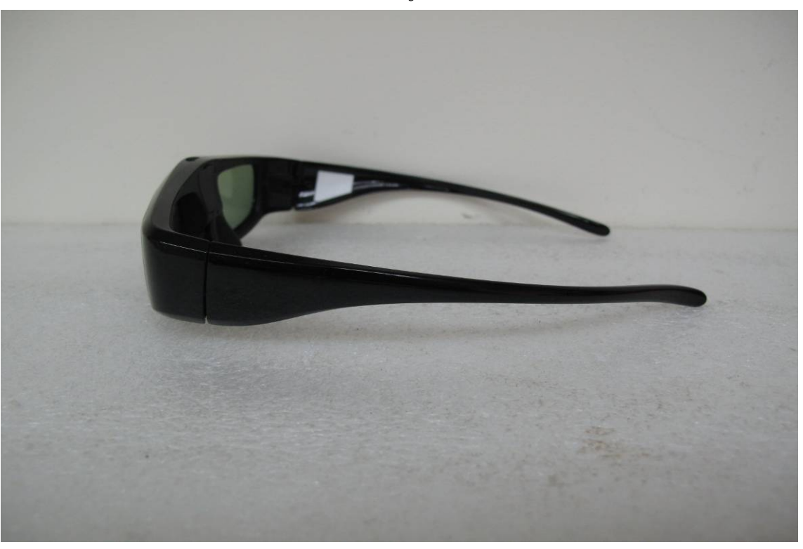
Side View of EUT - 2