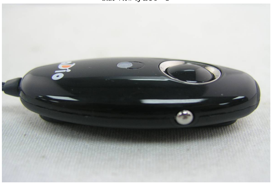
Side View of EUT - 3