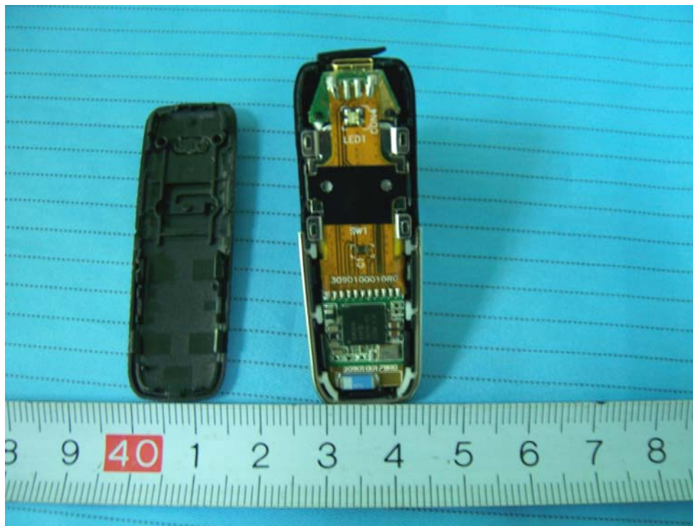
EUT- Main Board Components Top View