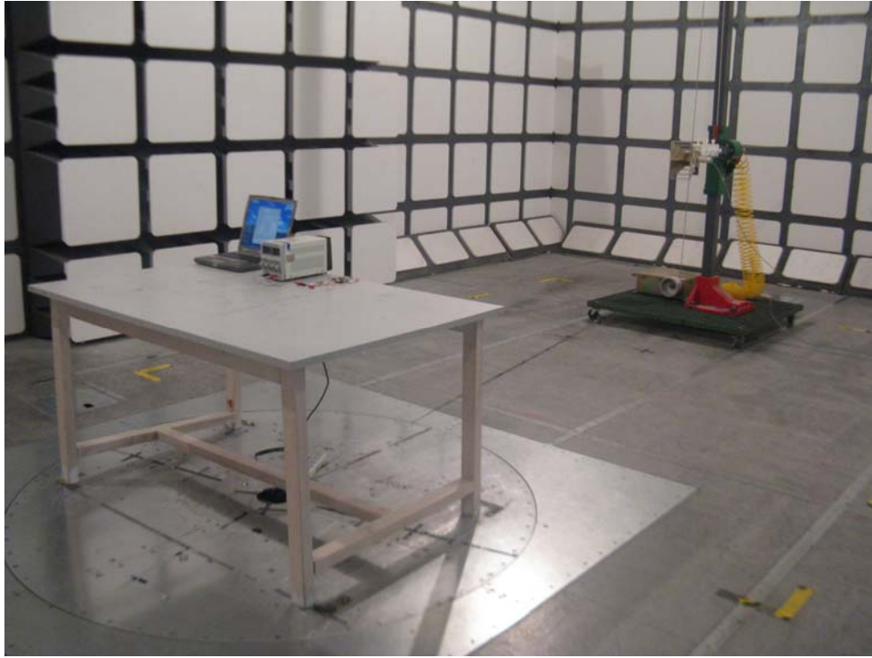
Radiated Emissions - Rear View for Transmitting Mode (Above 1 GHz)