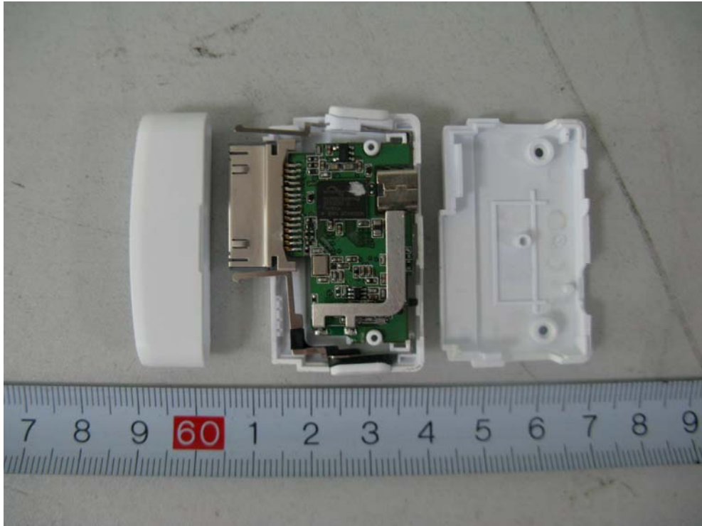
EUT – Main Board Top Components View (White Color)