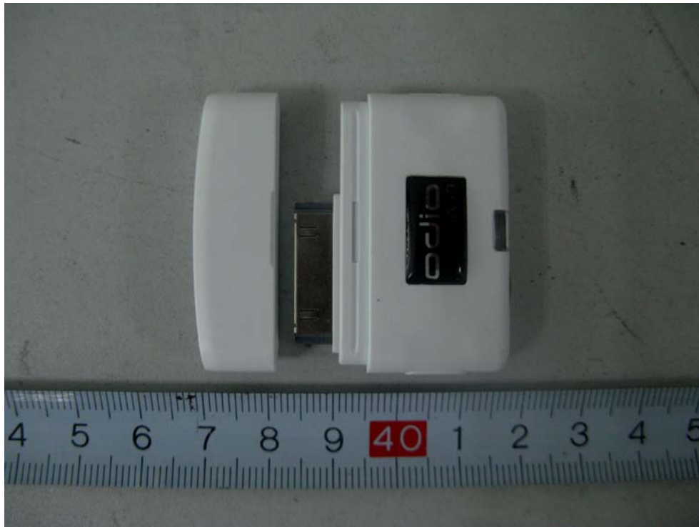
EUT – Cover off View (Black Color)