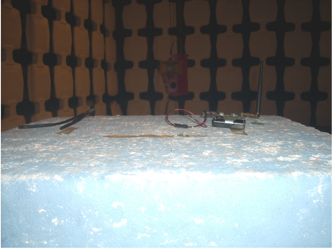
EMI - R