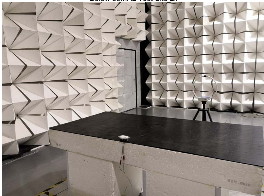
Below 30MHz Test Site 2#