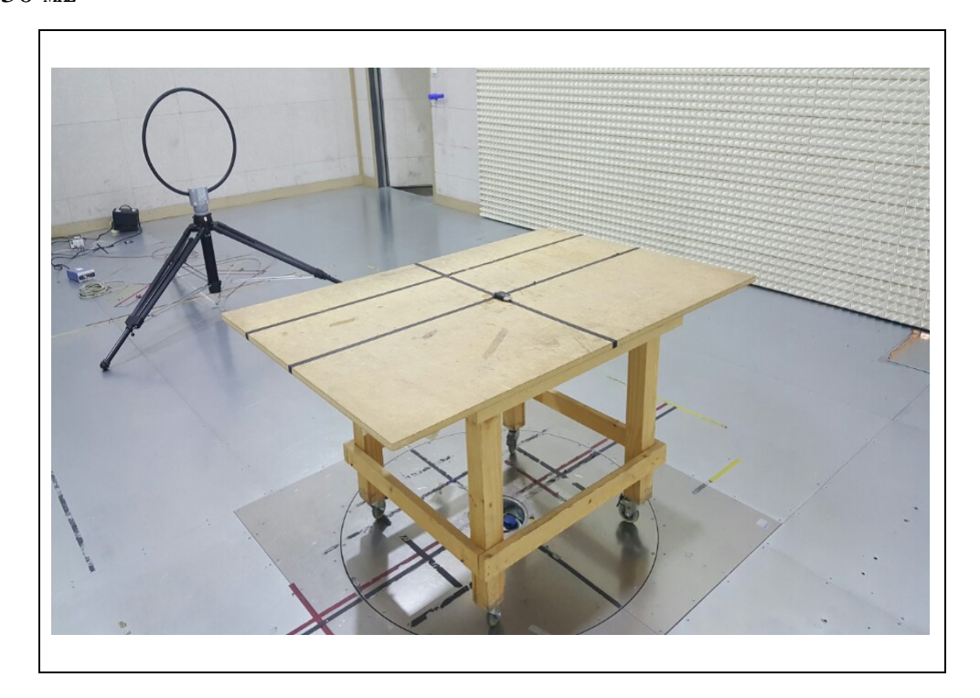
* 30 MHz \sim 1 GHz