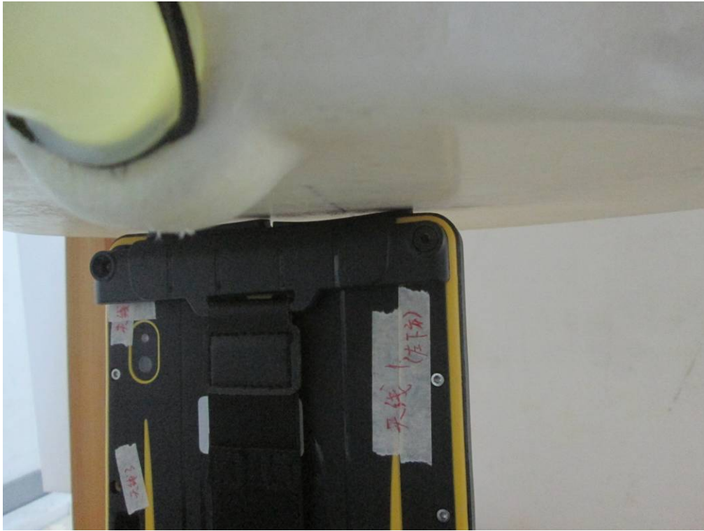
Body Bottom Setup Photo (0mm)