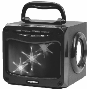
The picture is only provided for reference. Please refer to the actual unit ! SYLVANIA is a registered trademark of OSRAM Sylvania Inc. used under license.

Bluetooth Speaker MODEL NO: SP585 INSTRUCTION MANUAL