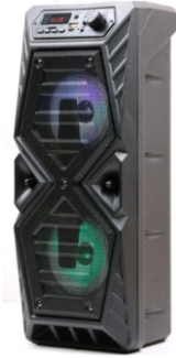
The picture is only provided for reference. Please refer to the actual unit! SYLVANIA is a registered trademark of OSRAM Sylvania Inc. used under license.

Bluetooth Speaker MODEL NO: SP417 INSTRUCTION MANUAL