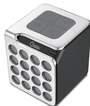
U171 User Manual