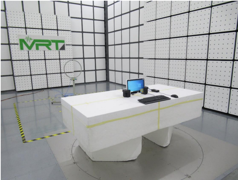
Description: Radiated Emission Test Setup for below 1GHz