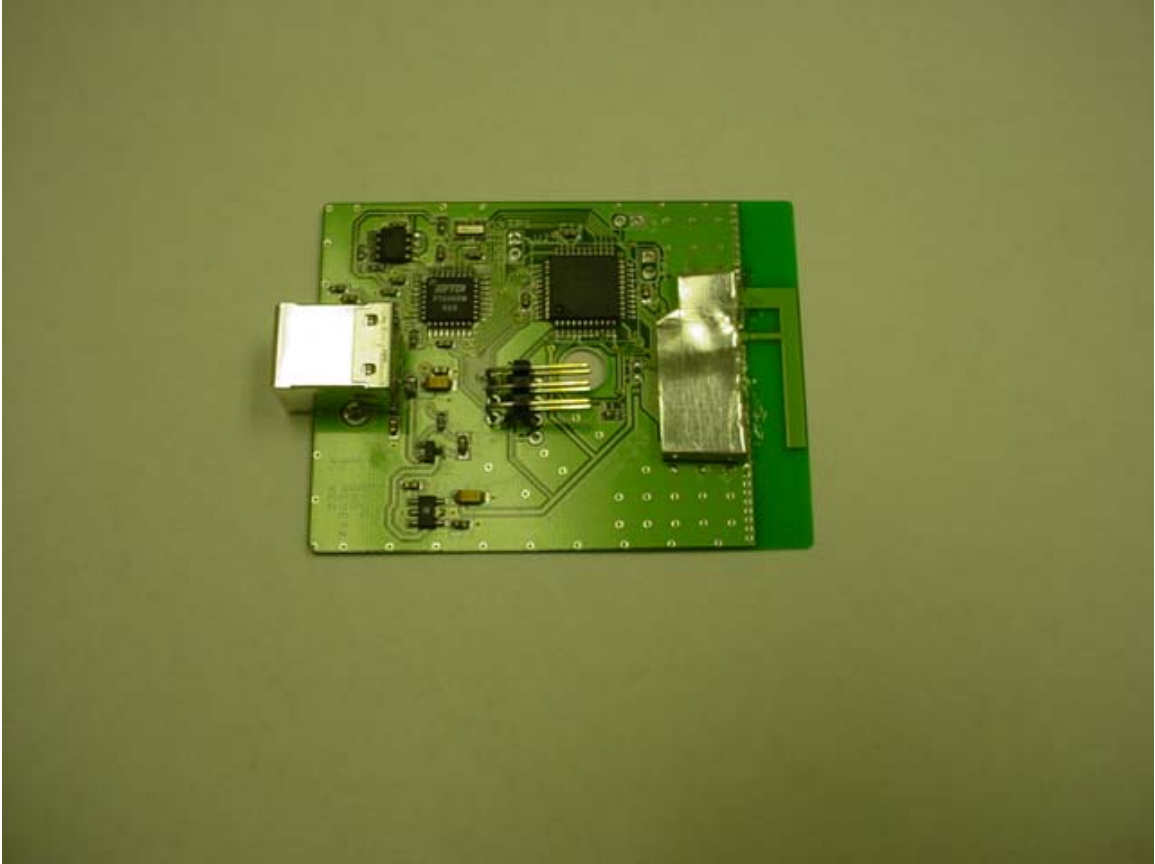
Prototyoe RF shielding