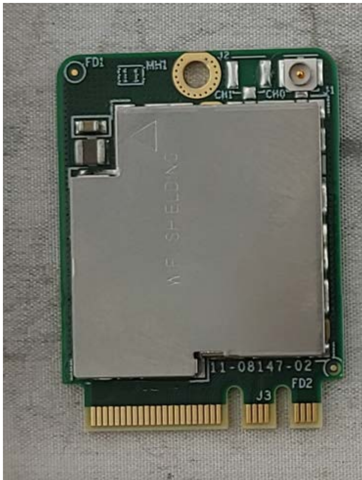
Photograph 2: Internal View Front Scanner PCB Can On