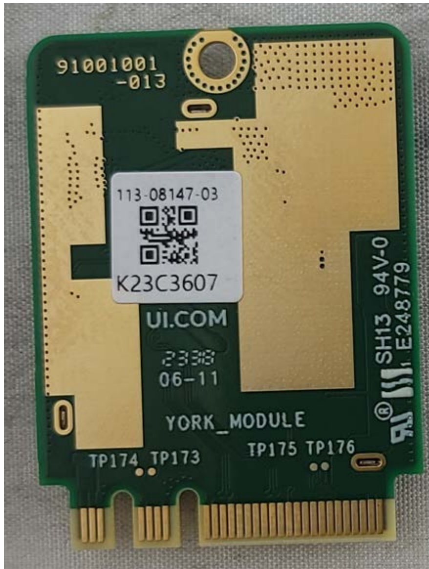
Photograph 4: Internal View Back Scanner PCB