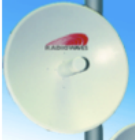
RadioWaves SP1.5 (2/3) -5.8 Gain: 31.4 dBi