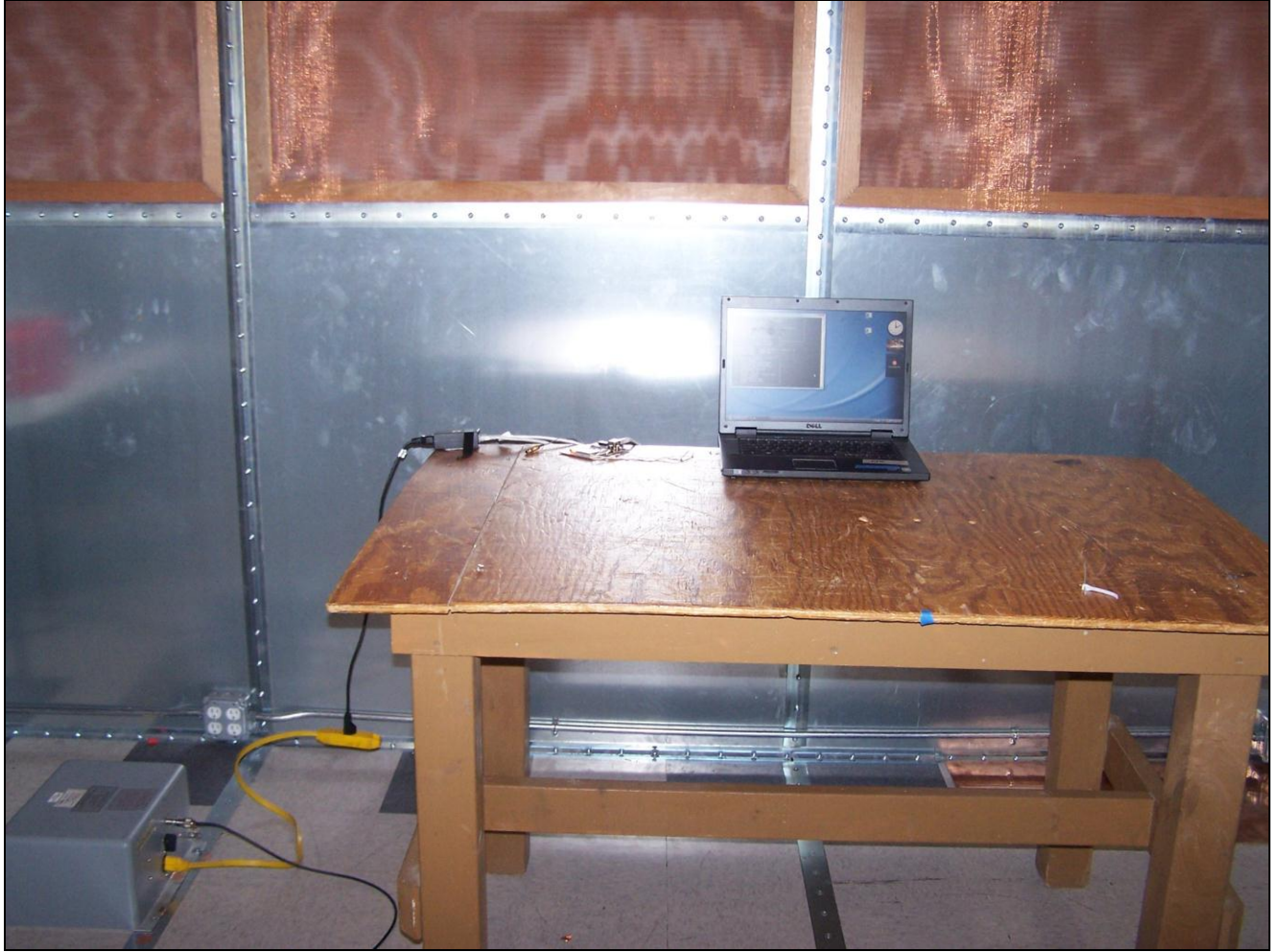
Photograph 3. Conducted Emissions, 15.207(a), Test Setup