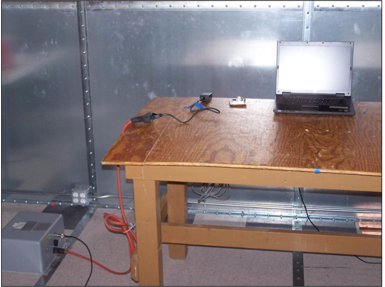
Photograph 1. Conducted Emissions, Test Setup