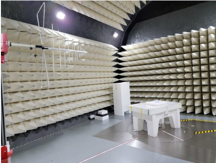
Photograph 3: View Test Set Up Radiated Emissions 30 – 1000 MHz