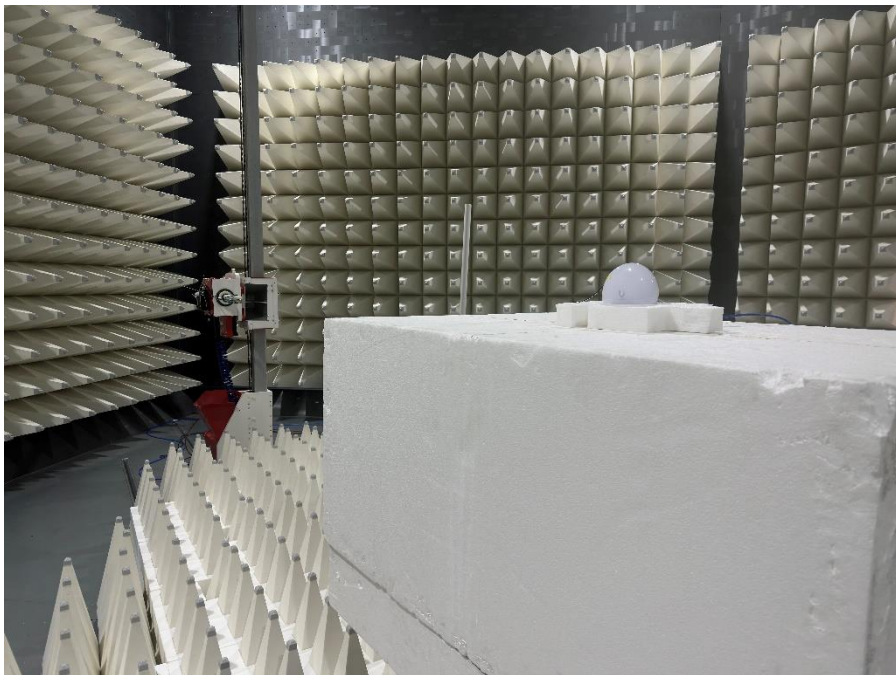
Photograph 4: View Test Set Up Radiated Emissions 1 – 17 GHz