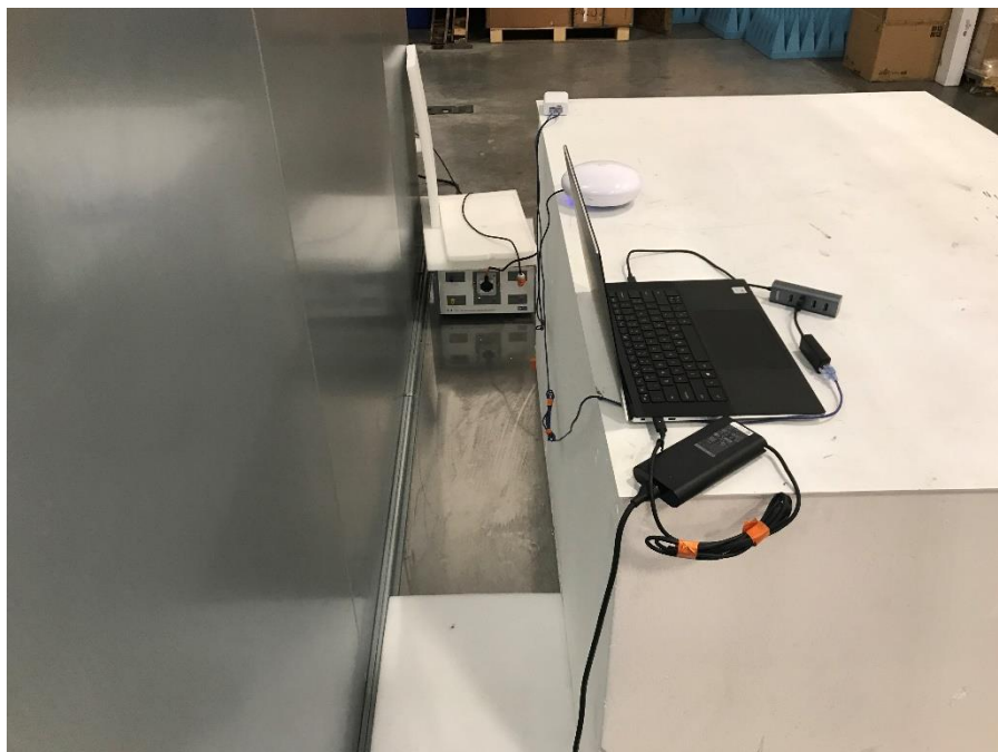
Photograph 2: Back View Test Set Up Conducted Emissions