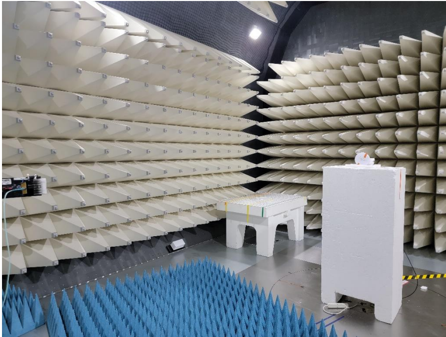
Photograph 5: View Test Set Up Radiated Emissions 17 - 40 GHz