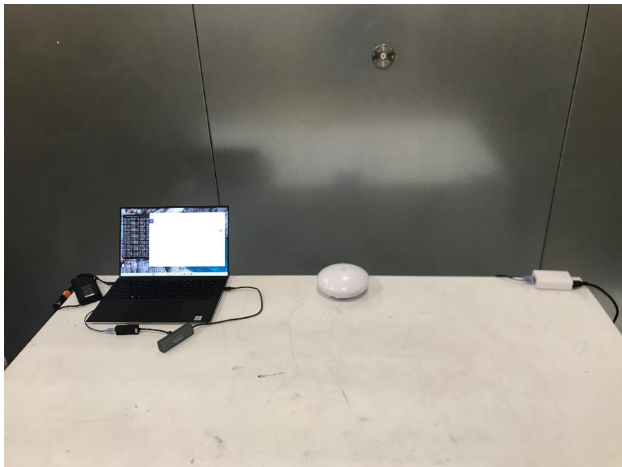
Photograph 1: Front View Test Set Up Conducted Emissions