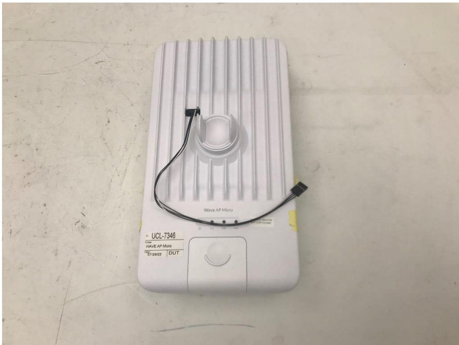
Photograph 2: Back View of DUT