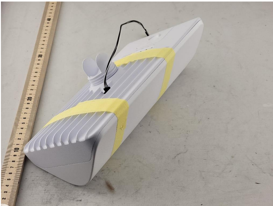
Photograph 4: Back / Side View of DUT