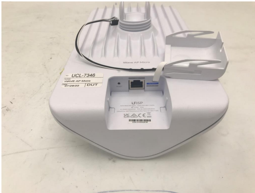
Photograph 6: Bottom / Input