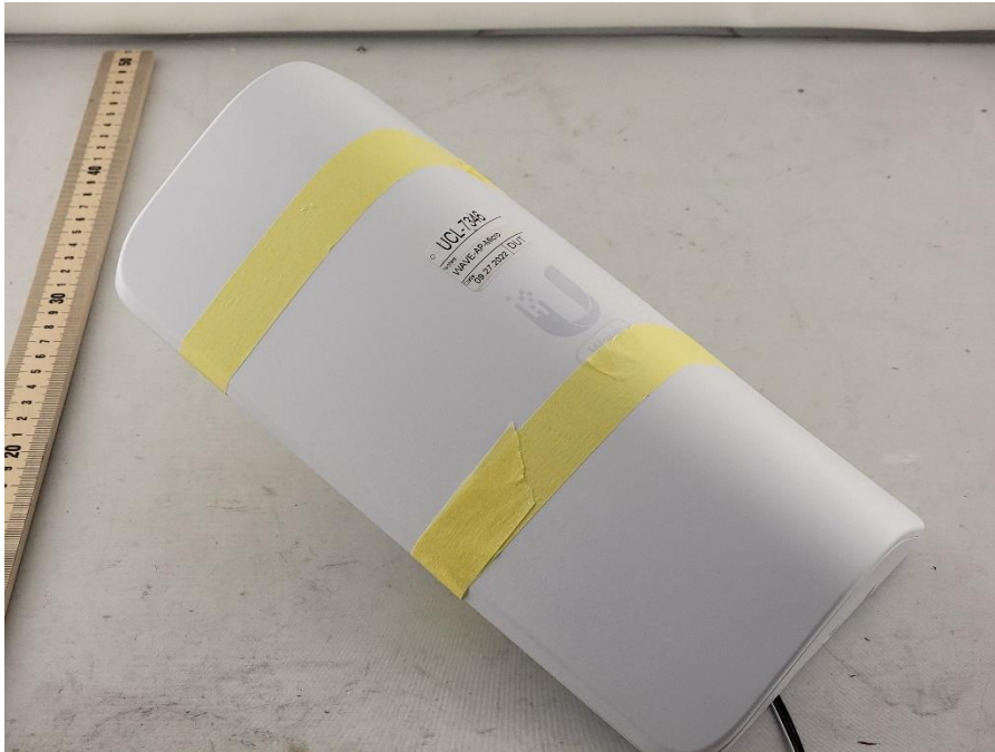
Photograph 3: Front / Side View of DUT