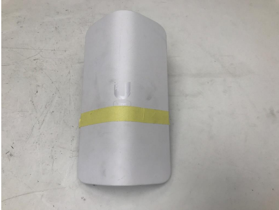
Photograph 1: Front View of DUT