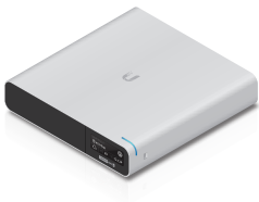
UniFi Cloud Key Gen2 Plus, model UCK-G2-PLUS

UniFi Protect is a flexible and powerful IP video surveillance system that can manage UniFi Protect cameras and the UniFi Protect mobile app. The software is free from all hosting and licensing fees and comes pre-installed on UniFi's Cloud Key Gen2 Plus, model UCK-G2-PLUS.