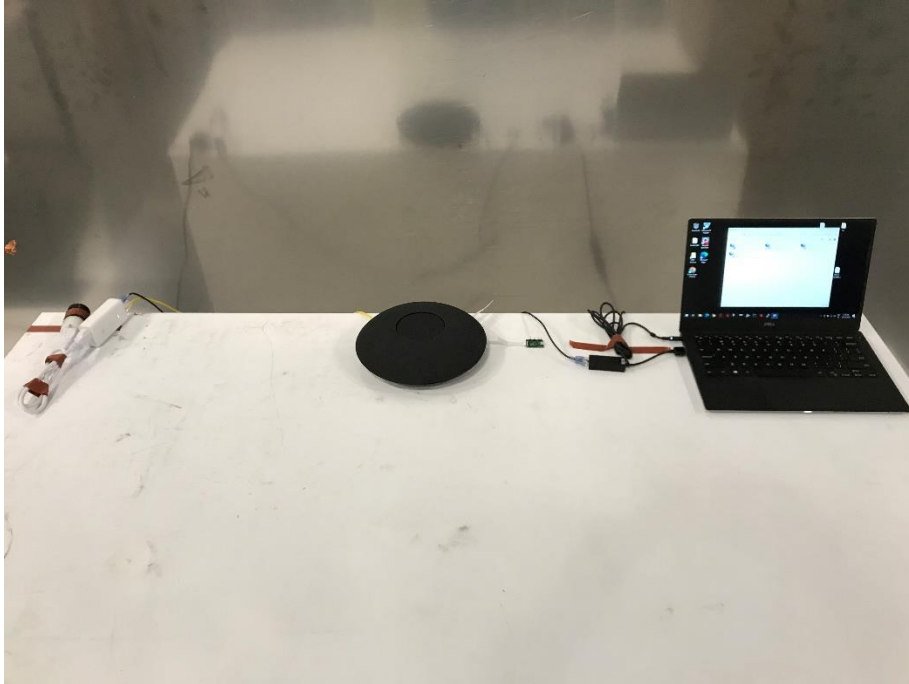
Photograph 3: Front View Test Set Up Conducted Emissions