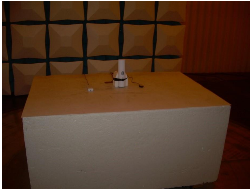
Photograph 1: Front View Radiated Emissions – Below 1000 MHz Configuration