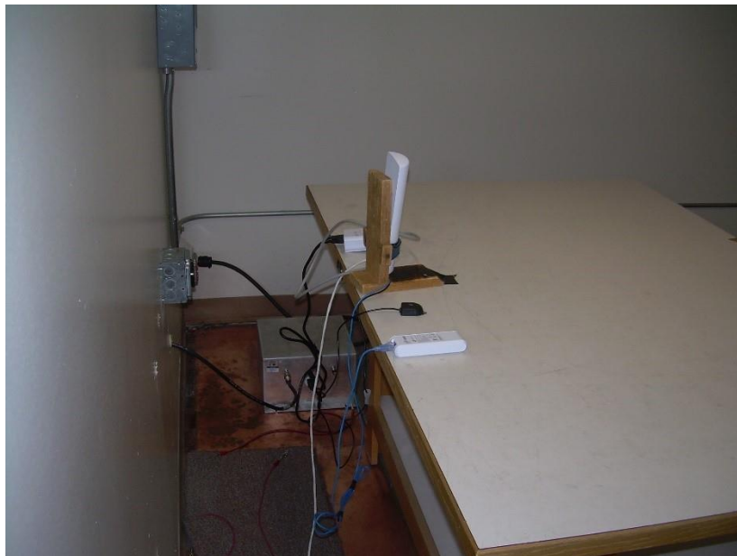
Photograph 6: Back View Conducted Emissions Worst-Case Configuration