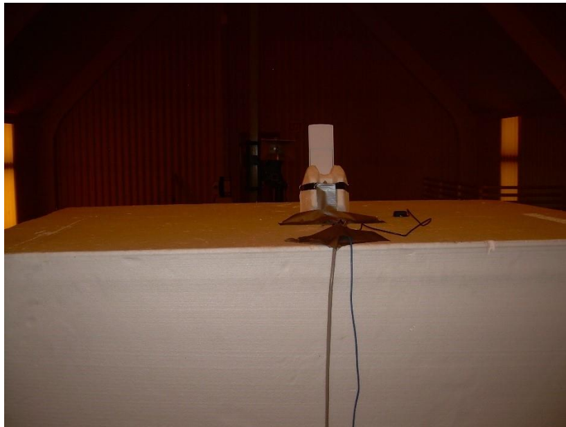
Photograph 4: Back View Radiated Emissions – Above 1000 MHz Configuration