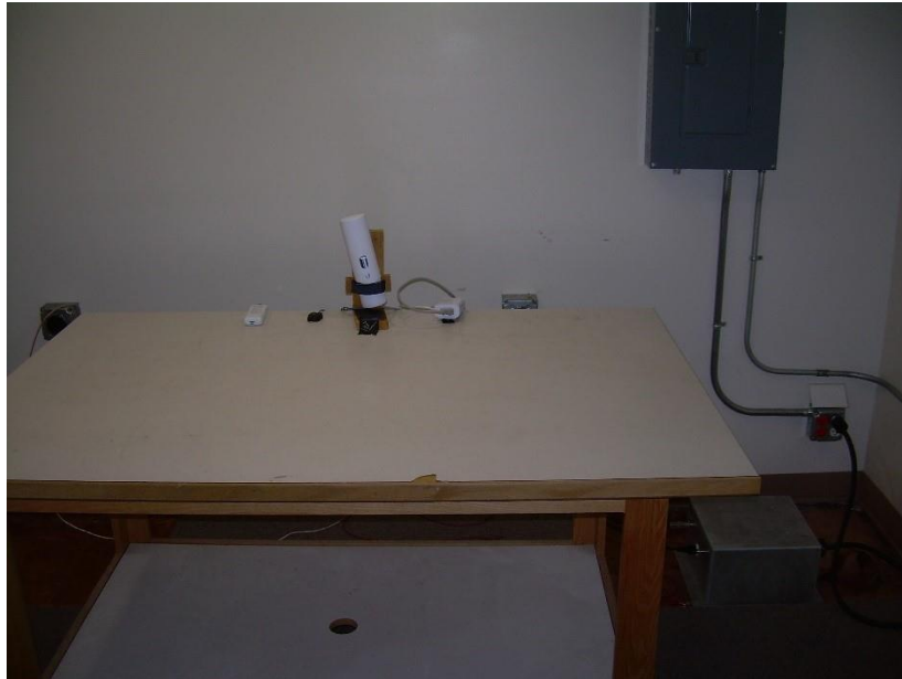
Photograph 5: Front View Conducted Emissions Worst-Case Configuration