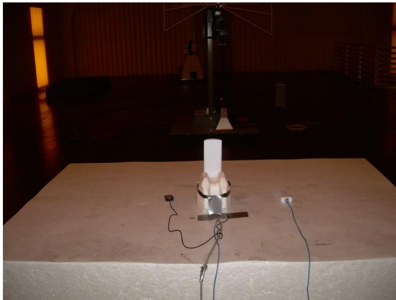
Photograph 2: Back View Radiated Emissions 30 MHz to 1000 Configuration