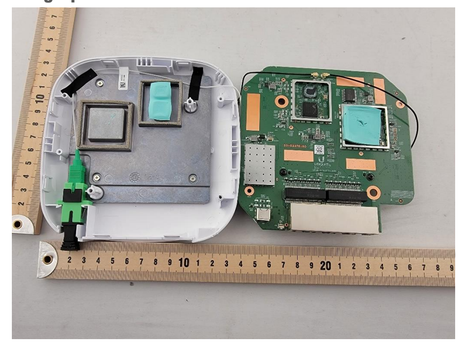
Photograph 2: Back View of Circuit Board and Back Heat Sink