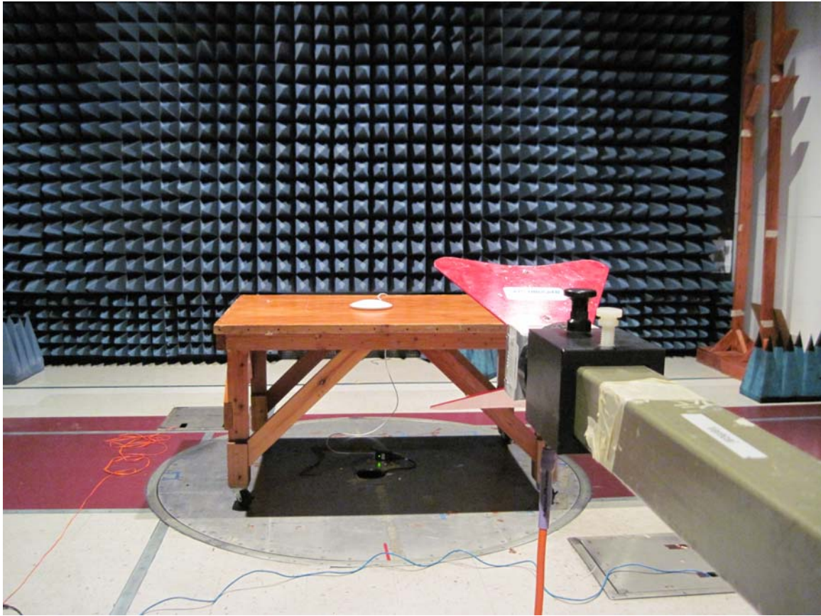
Photograph 1. Radiated Spurious Emissions @ 3 m