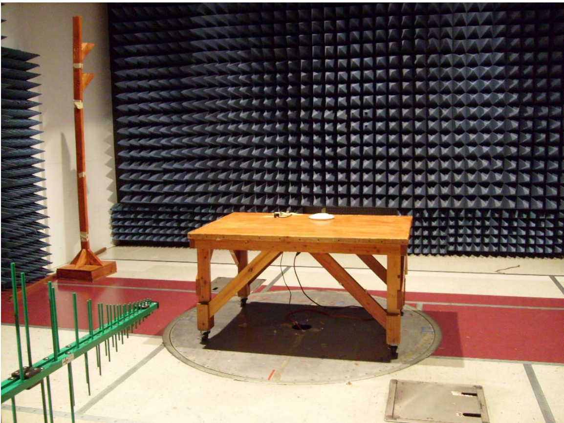
Photograph 4. Radiated Emissions