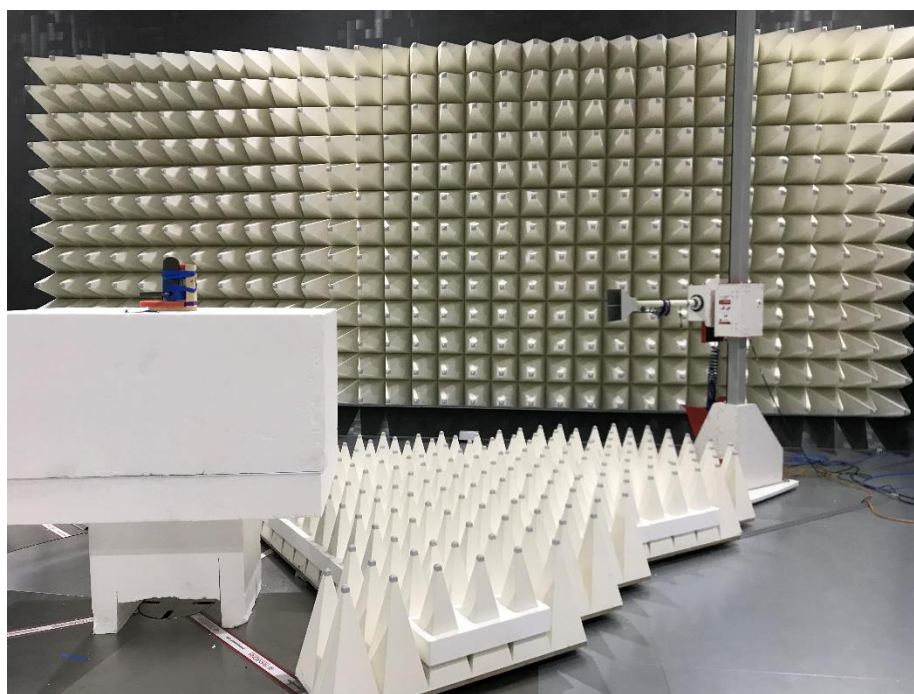
Photograph 2: Test Setup Radiated Emissions 1 – 17 GHz