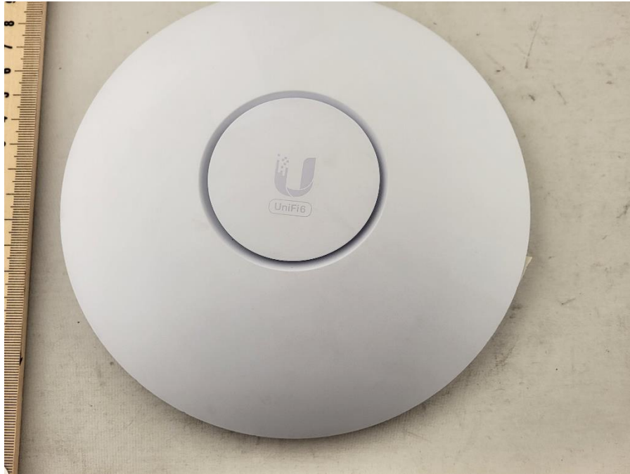
Photograph 1: Front View of DUT