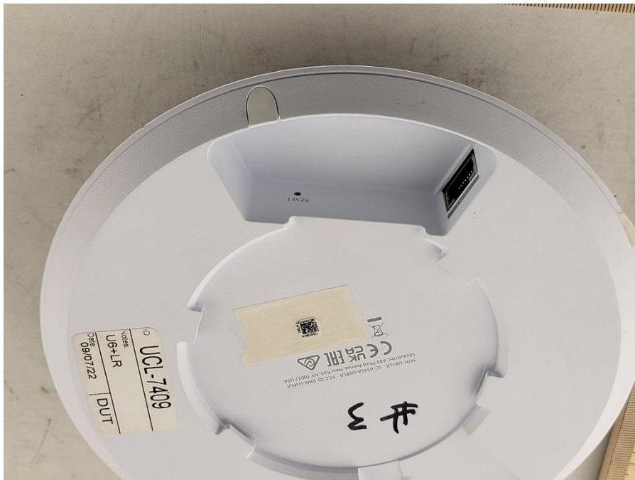
Photograph 4: Side 2