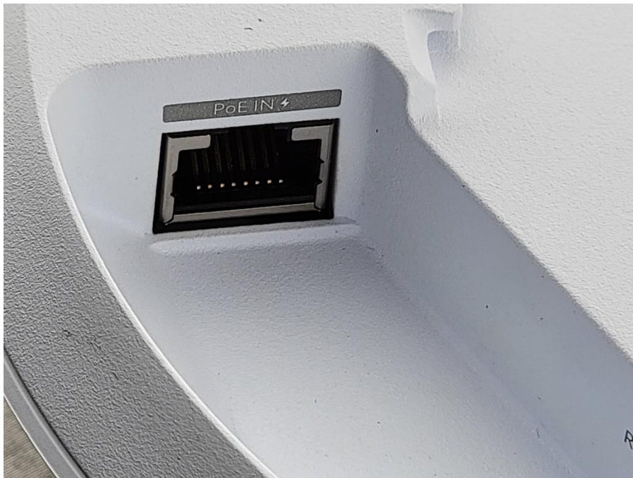
Photograph 6: Input Connector