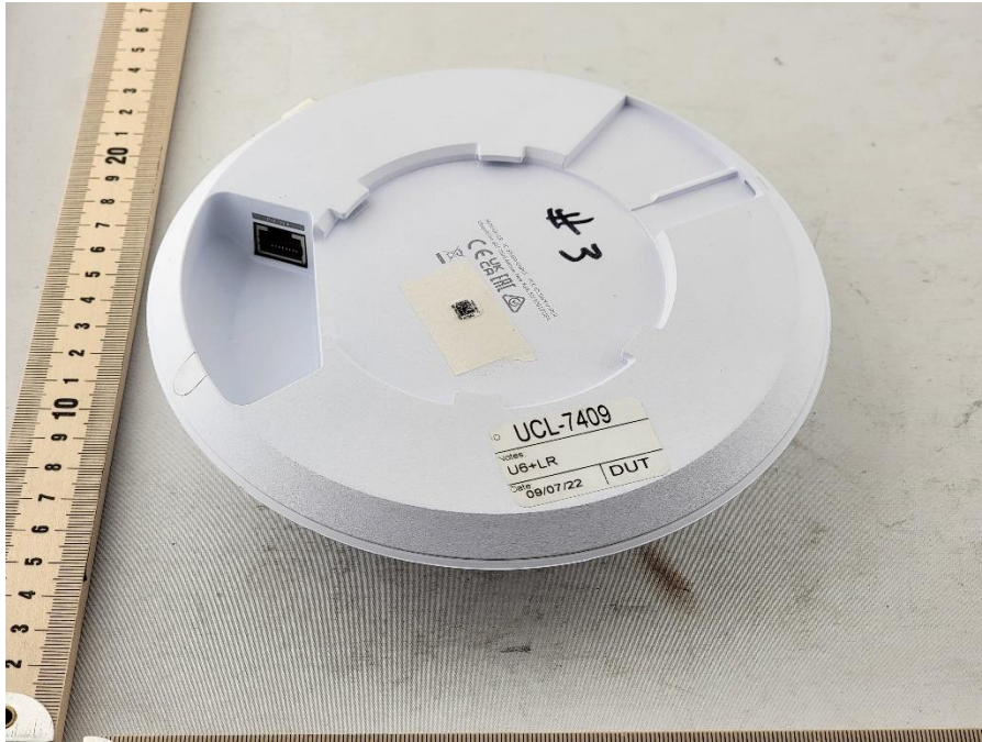
Photograph 5: Side 3