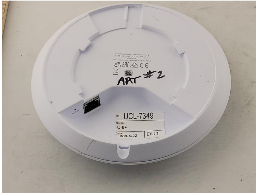
Photograph 3: Back View of DUT Ingress Cover Off Side 1