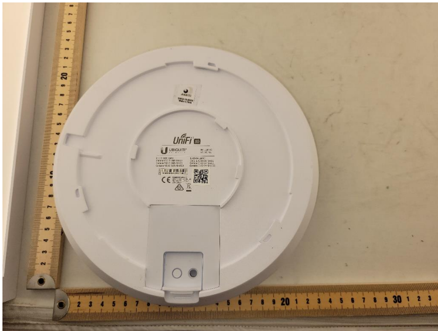
Photograph 2: Back View of DUT Ingress Cover On