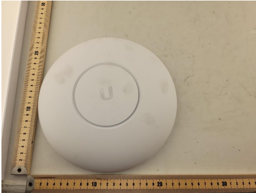
Photograph 1: Front View of DUT