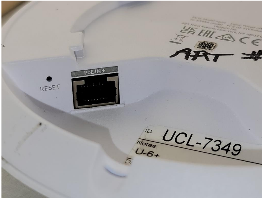
Photograph 7: Connector