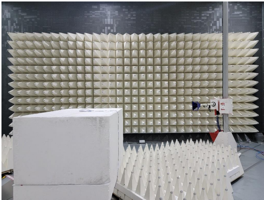
Photograph 2: View Test Set Up Radiated Emissions 1 – 17 GHz