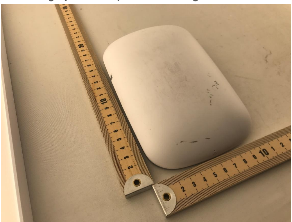
Photograph 2: Front, Bottom and Left Side View of DUT