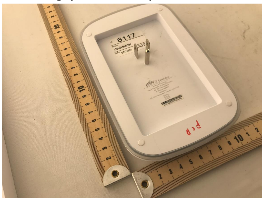
Photograph 4: Back, Bottom and Right View of DUT