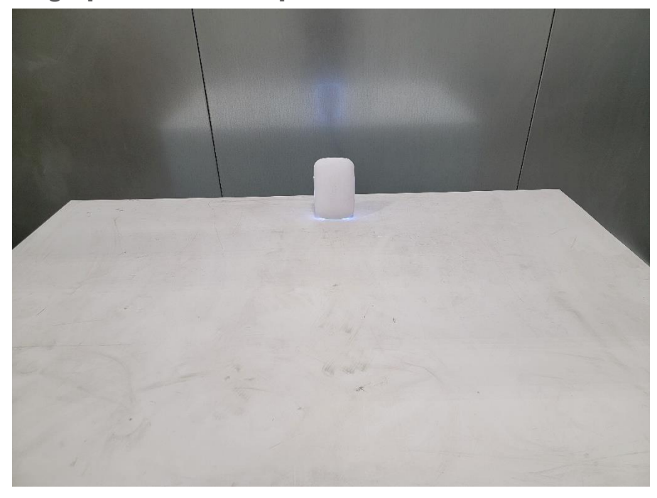
Photograph 4: Front Test Set Up AC Mains Conducted Emissions