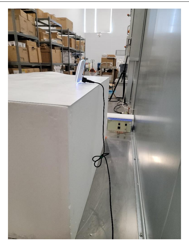
Photograph 5: Back Test Set Up AC Mains Conducted Emissions