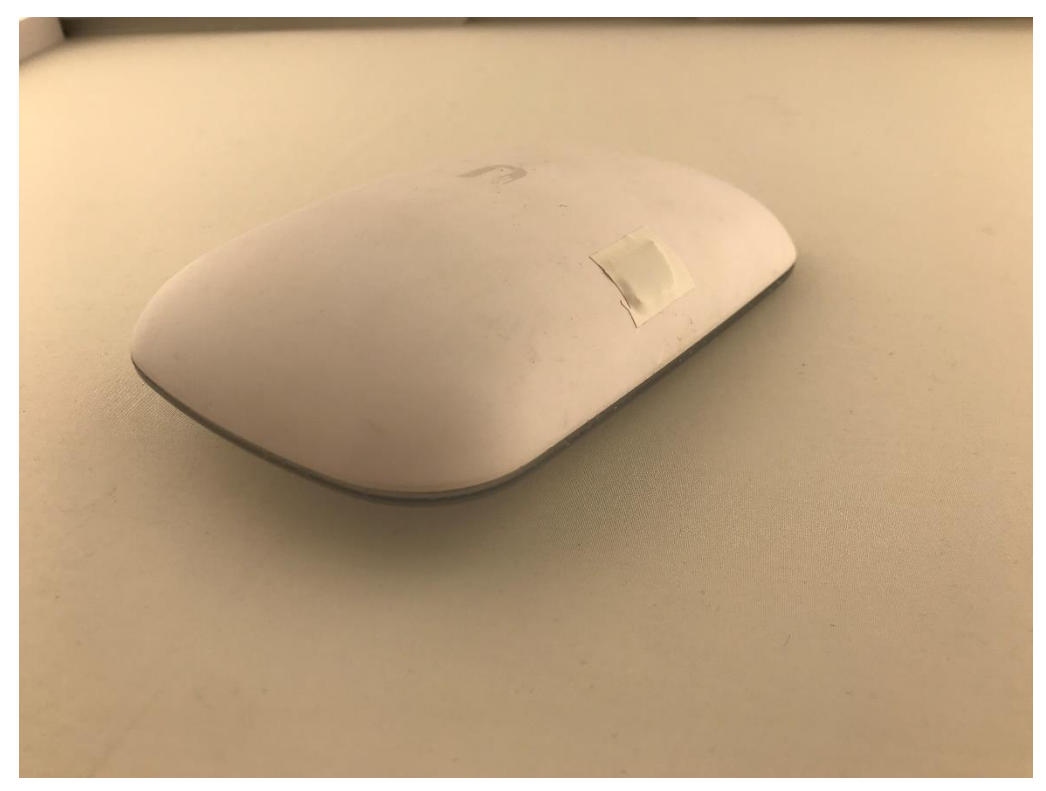
Photograph 3: Top and Left-Side View of DUT