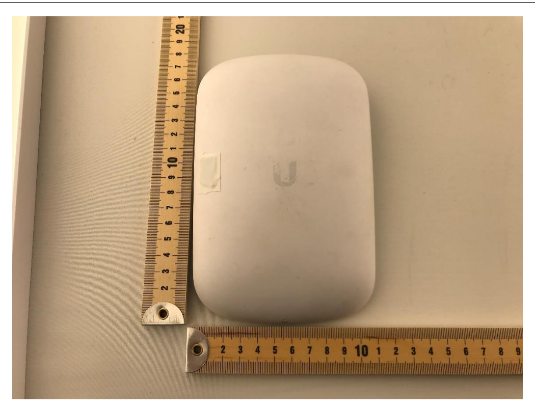
Photograph 1: Front View of DUT