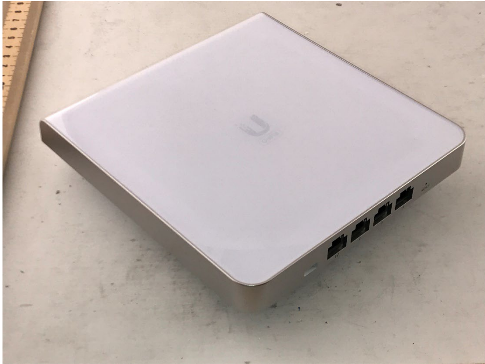
Bottom / Side 1 / Front