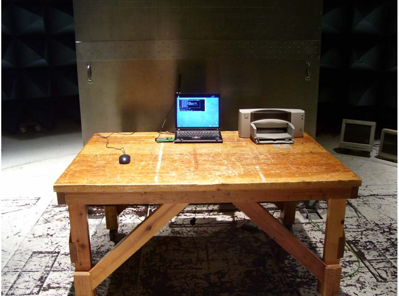
Photograph 1. Conducted Emissions Test Setup