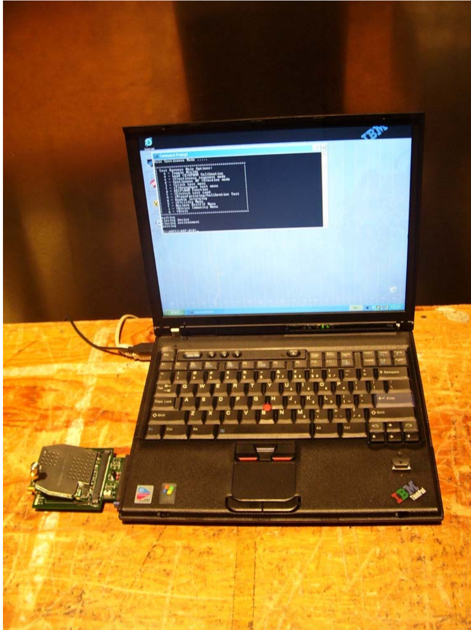
Photograph 4 Test Equipment and setup for various Radiated Measurements