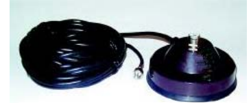
MM-110 Large Magnetic Mount