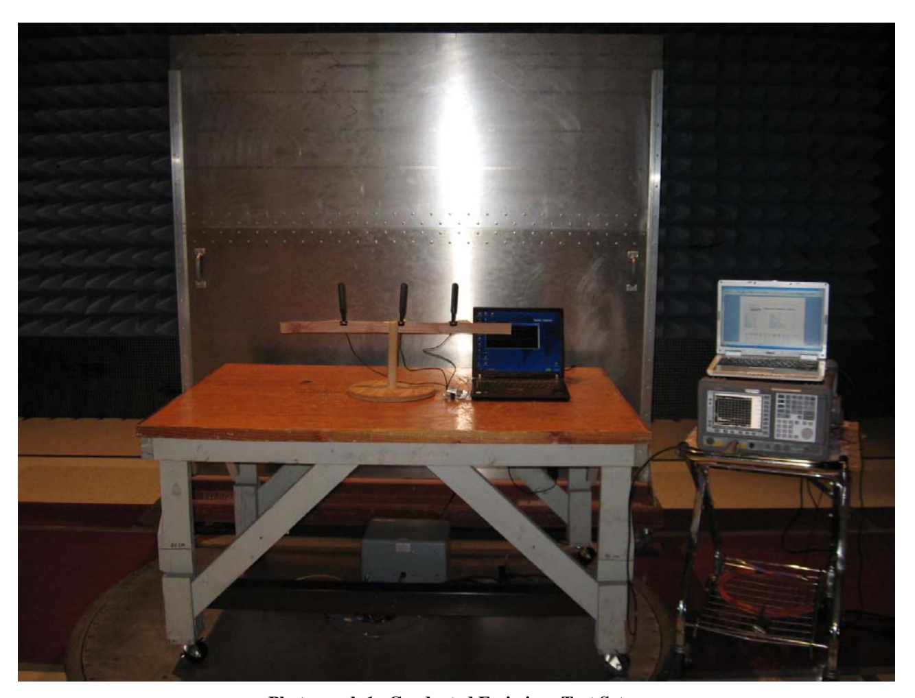
Photograph 1. Conducted Emissions Test Setup