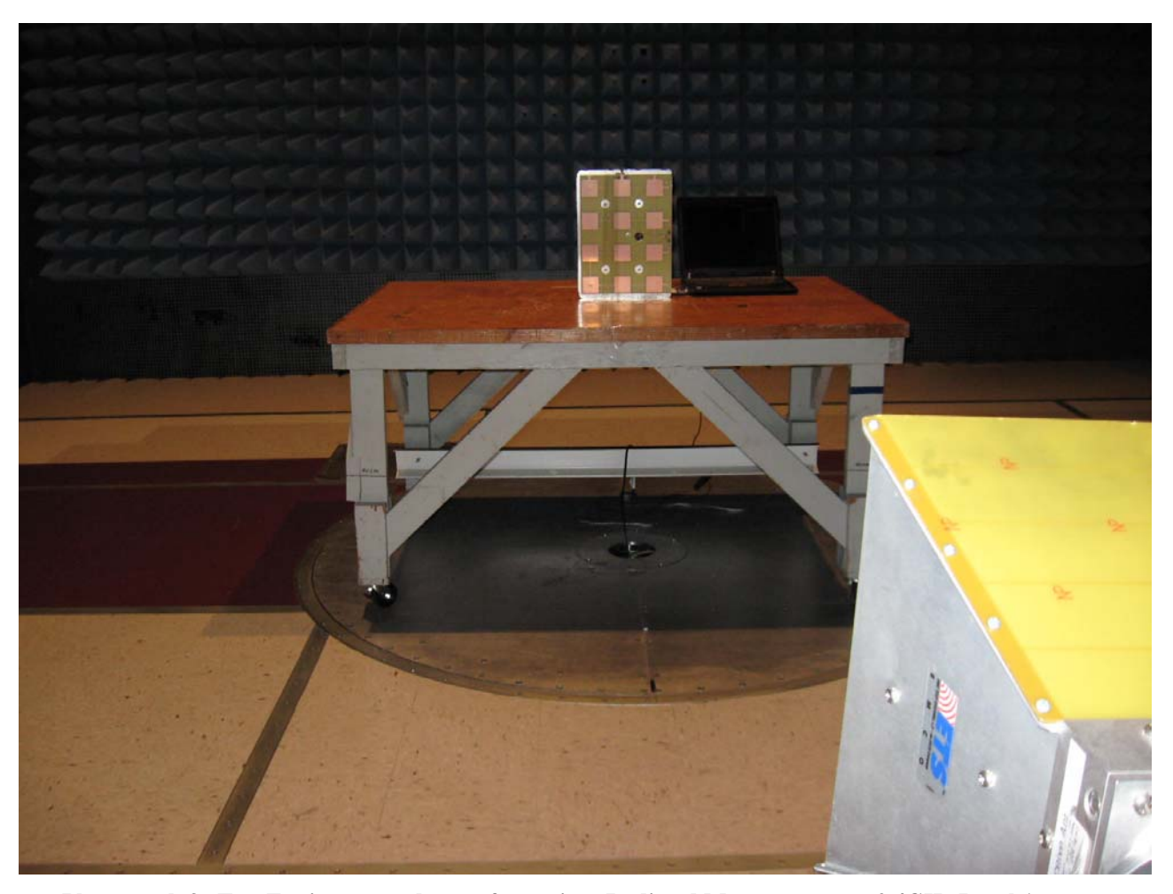
Photograph 3. Test Equipment and setup for various Radiated Measurements – 2.4GHz Panel Antenna