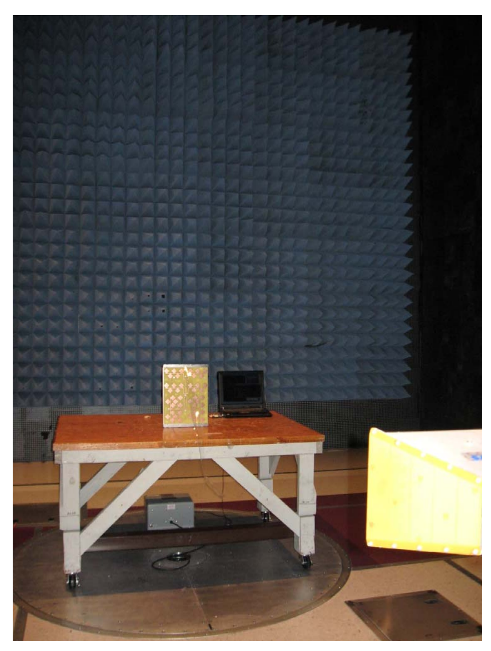
Photograph 5. Test Equipment and setup for various Radiated Measurements – 5.8GHz Panel Antenna