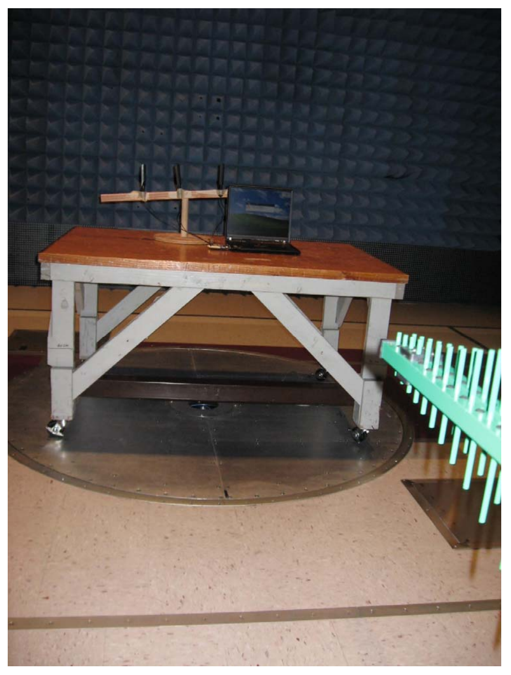
Photograph 2. Radiated Emission Test Setup 30 MHz - 1 GHz