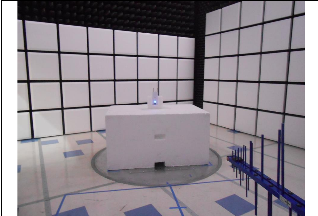
RF Radiated #2