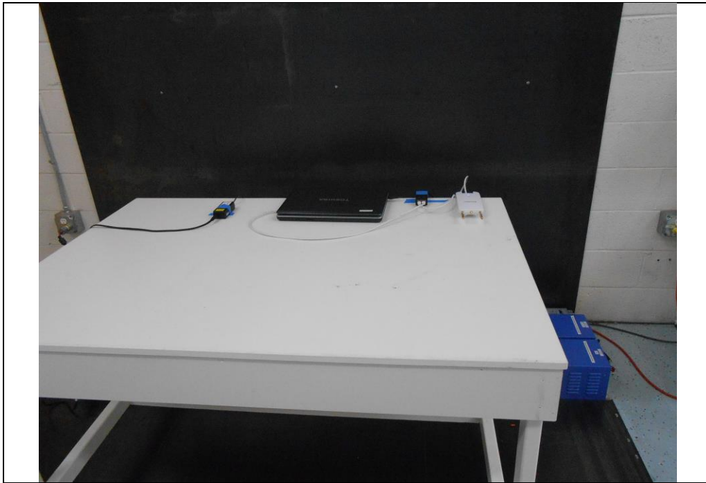
A/C Powerline Conduction #2