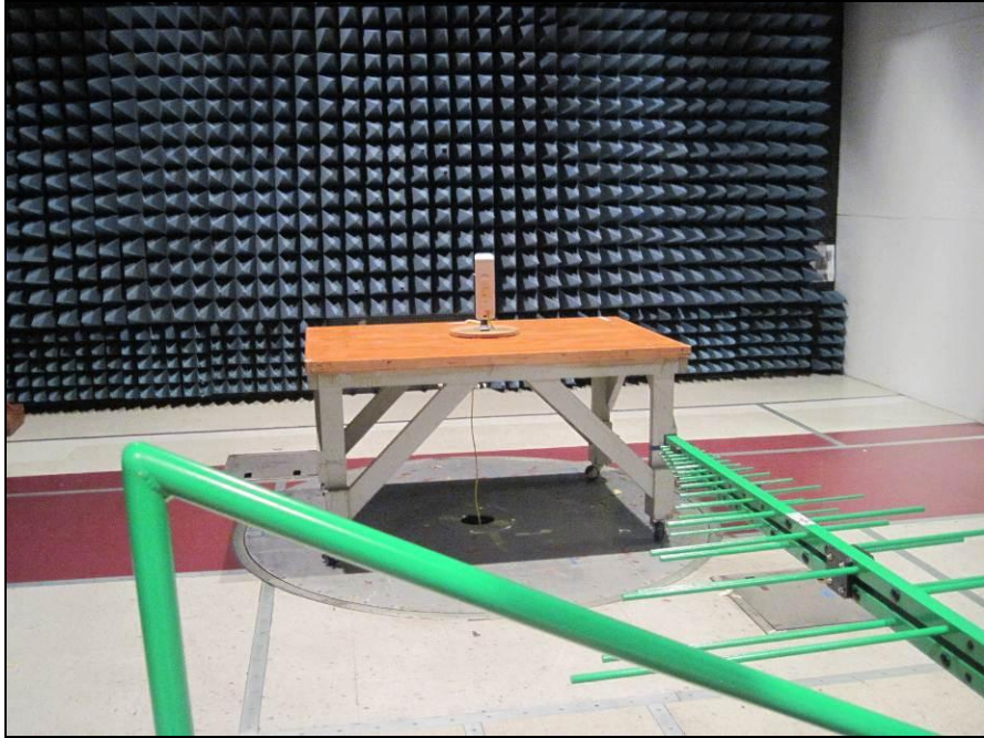
Photograph 4. Radiated Spurious Emissions, Test Setup, 30 MHz – 1 GHz