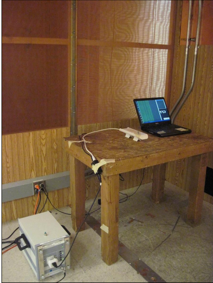
Photograph 3. Conducted Emissions, 15.207(a), Test Setup