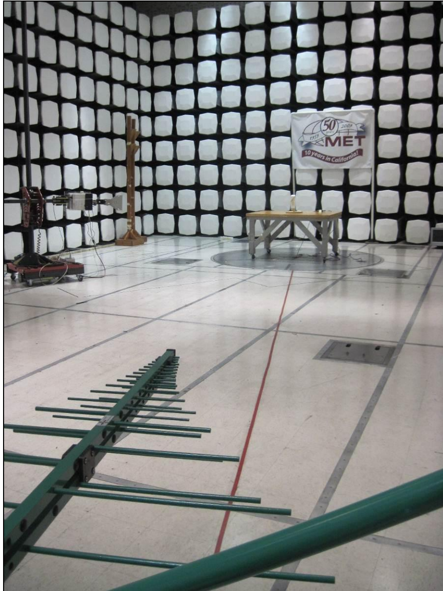
Photograph 2. Radiated Emission, Test Setup