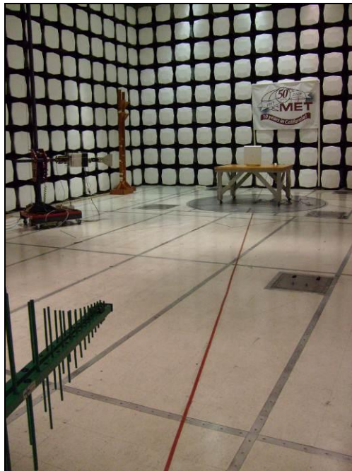
Photograph 5. Radiated Spurious Emissions, Test Setup, 30 MHz – 1 GHz