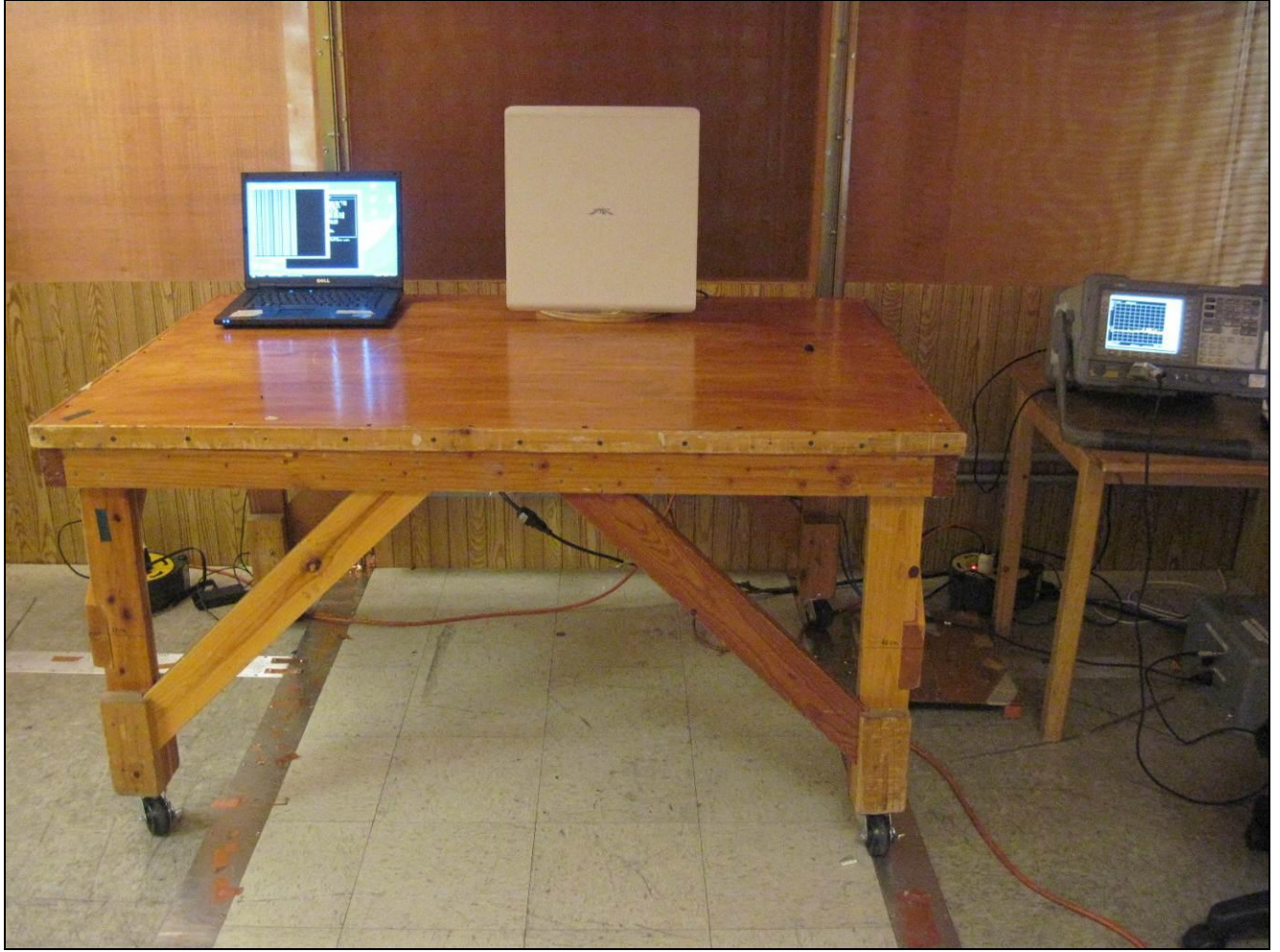
Photograph 3. Conducted Emissions, 15.207(a), Test Setup