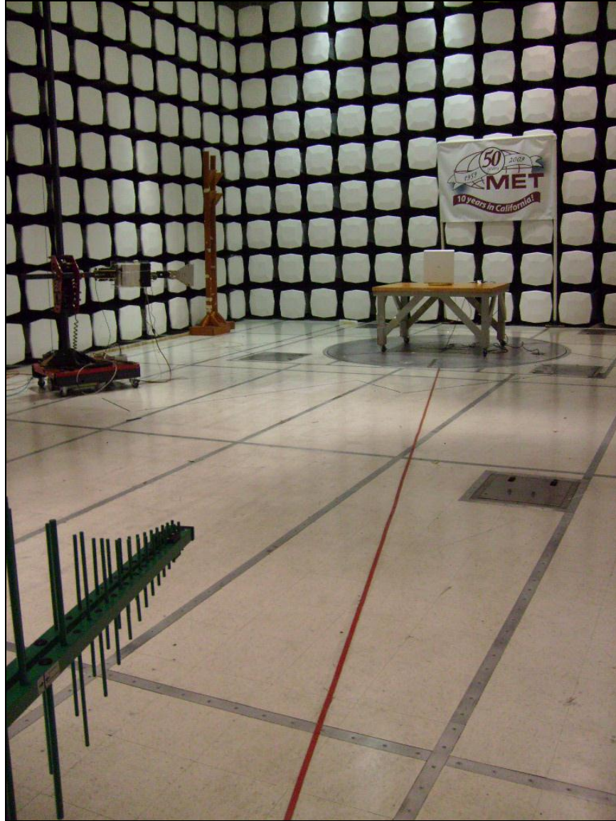
Photograph 2. Radiated Emission, Test Setup