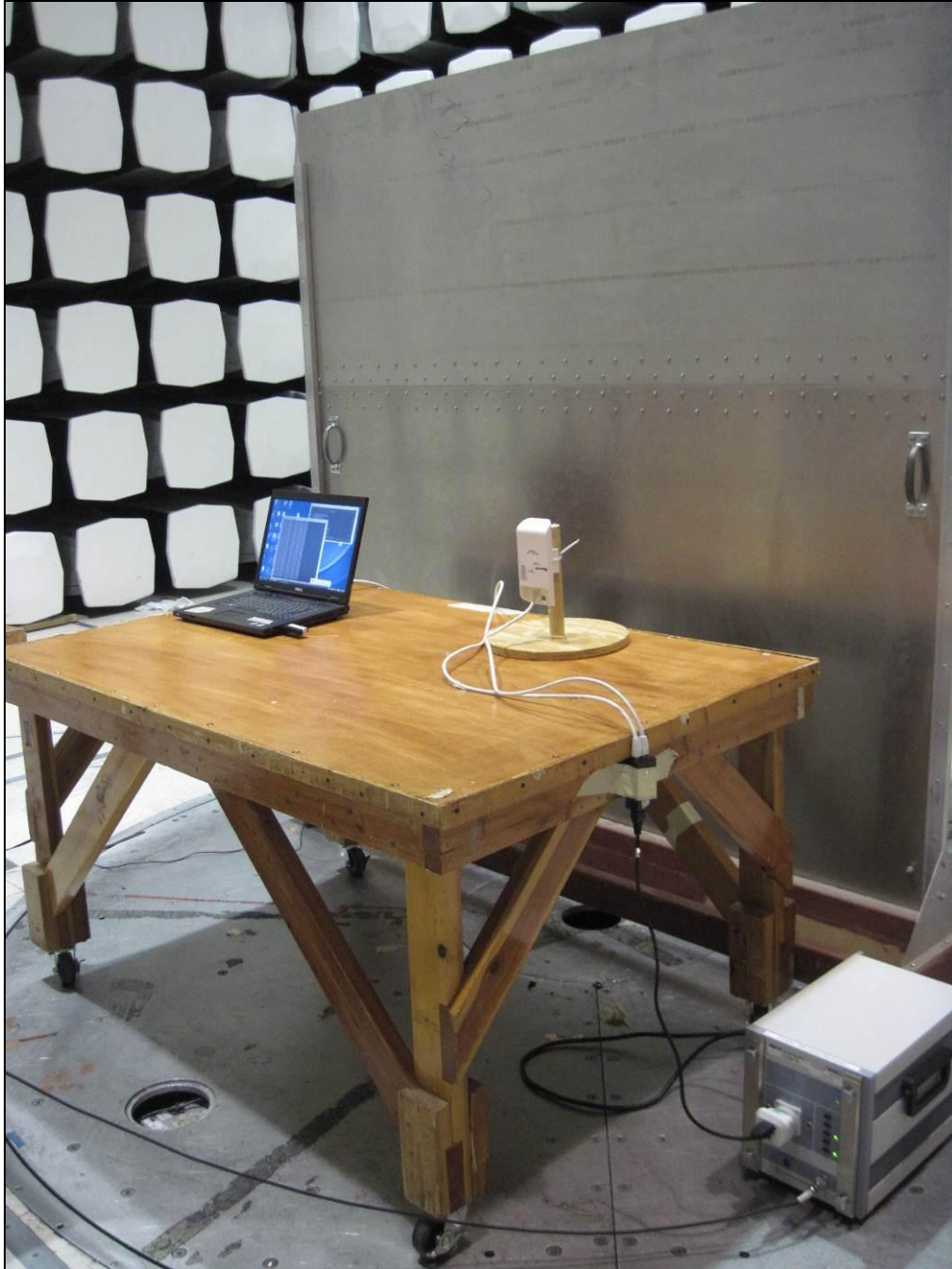
Photograph 3. Conducted Emissions, 15.207(a), Test Setup