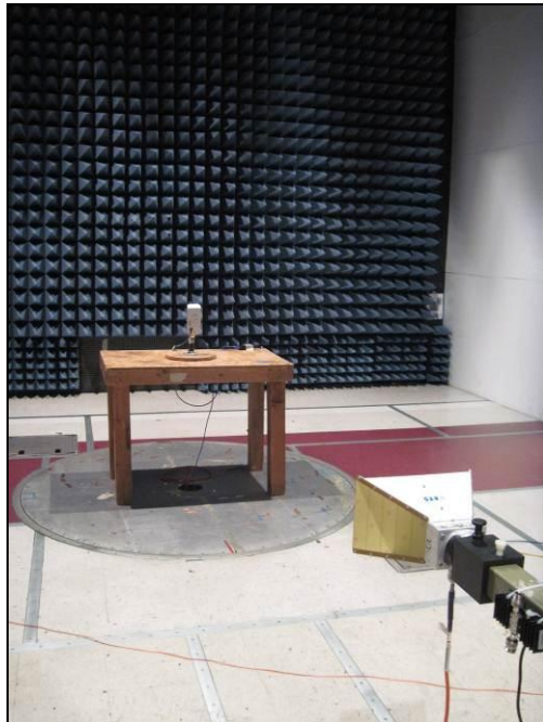
Photograph 5. Radiated Spurious Emissions, Test Setup, 1 GHz – 18 GHz