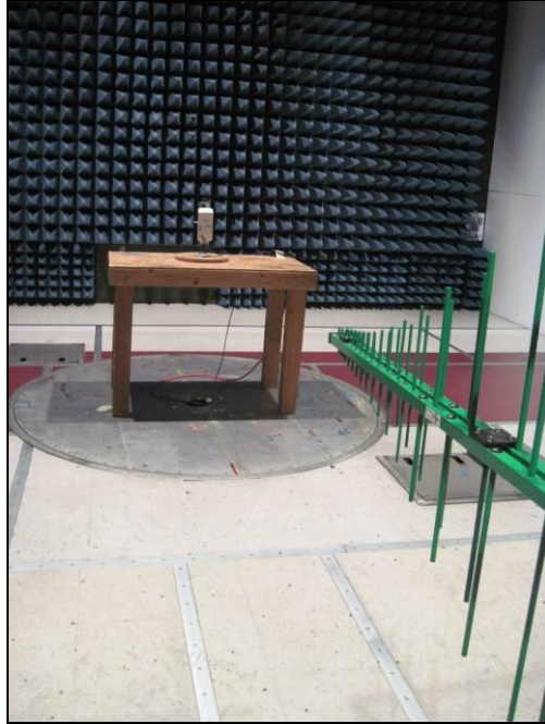
Photograph 4. Radiated Spurious Emissions, Test Setup, 30 MHz – 1 GHz