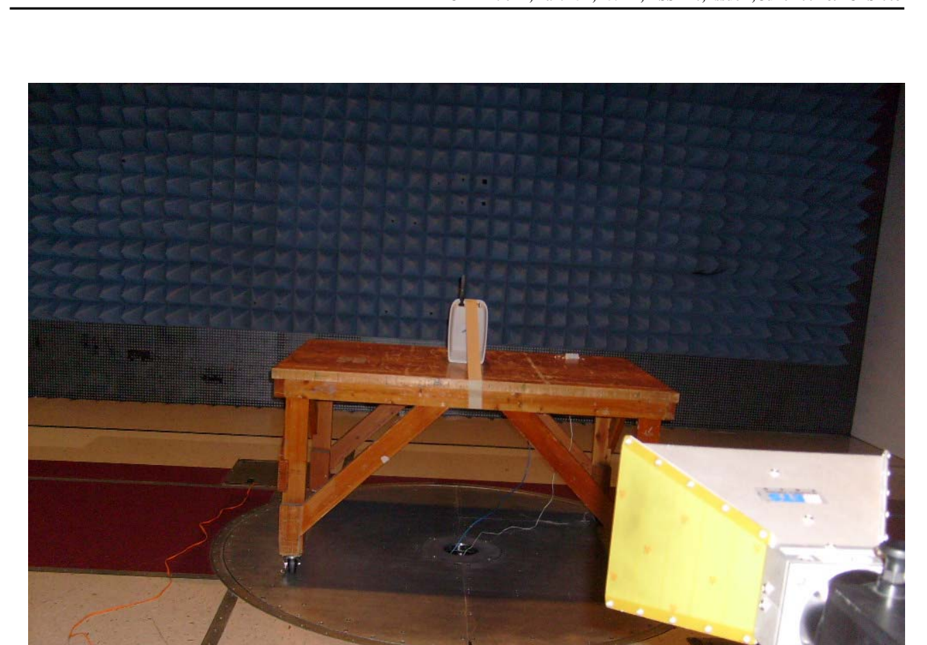
Photograph 4. Radiated Emission Test Setup 1GHz – 2GHz