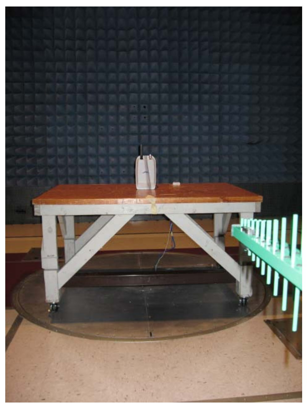
Photograph 3. Radiated Emission Test Setup 30 MHz - 1 GHz