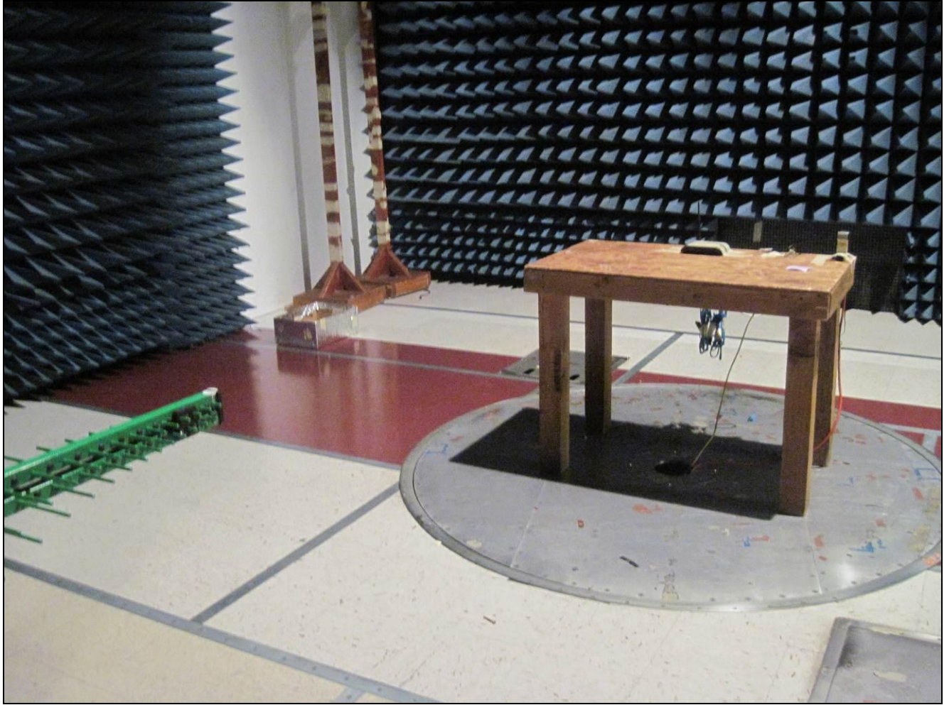
Photograph 2. Radiated Emission, Test Setup, 30 MHz – 1 GHz