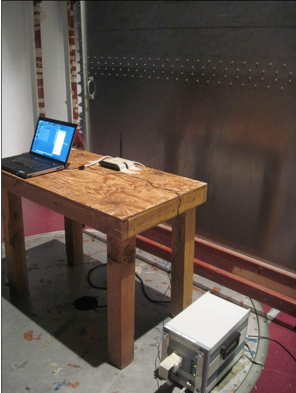
Photograph 1. Conducted Emissions, Test Setup