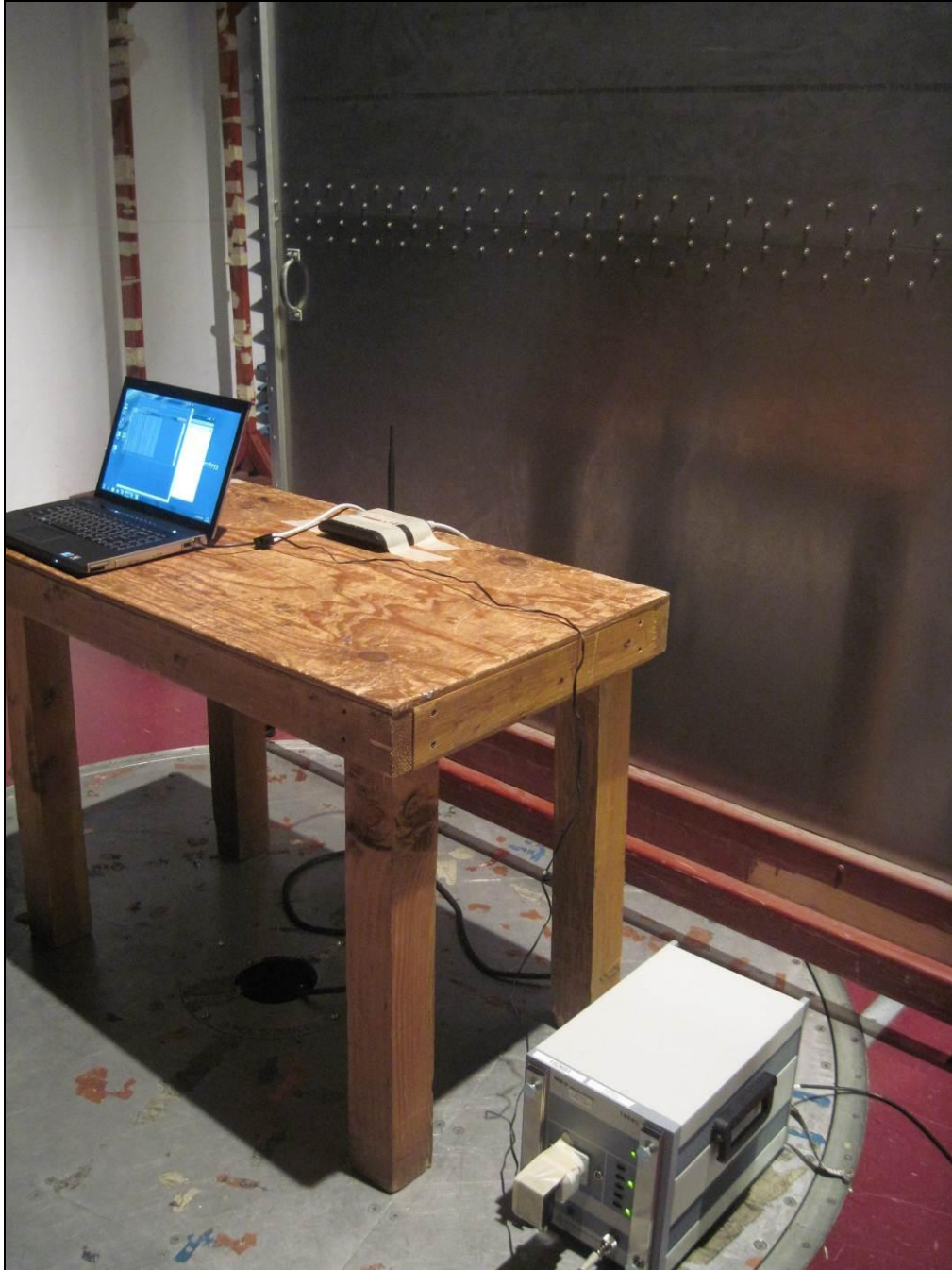
Photograph 3. Conducted Emissions, 15.207(a), Test Setup