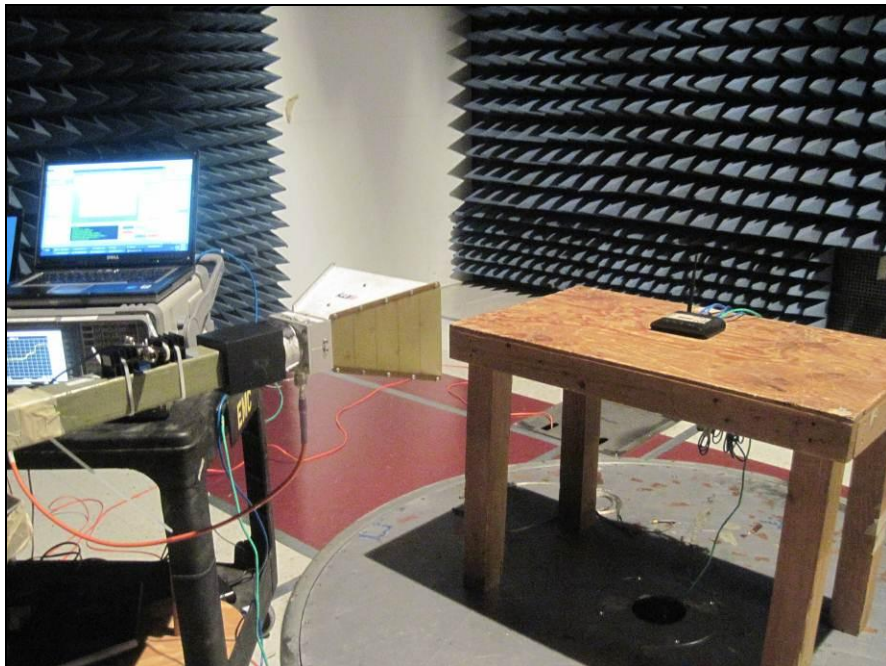
Photograph 5. Radiated Spurious Emissions, Test Setup, 1 GHz – 18 GHz