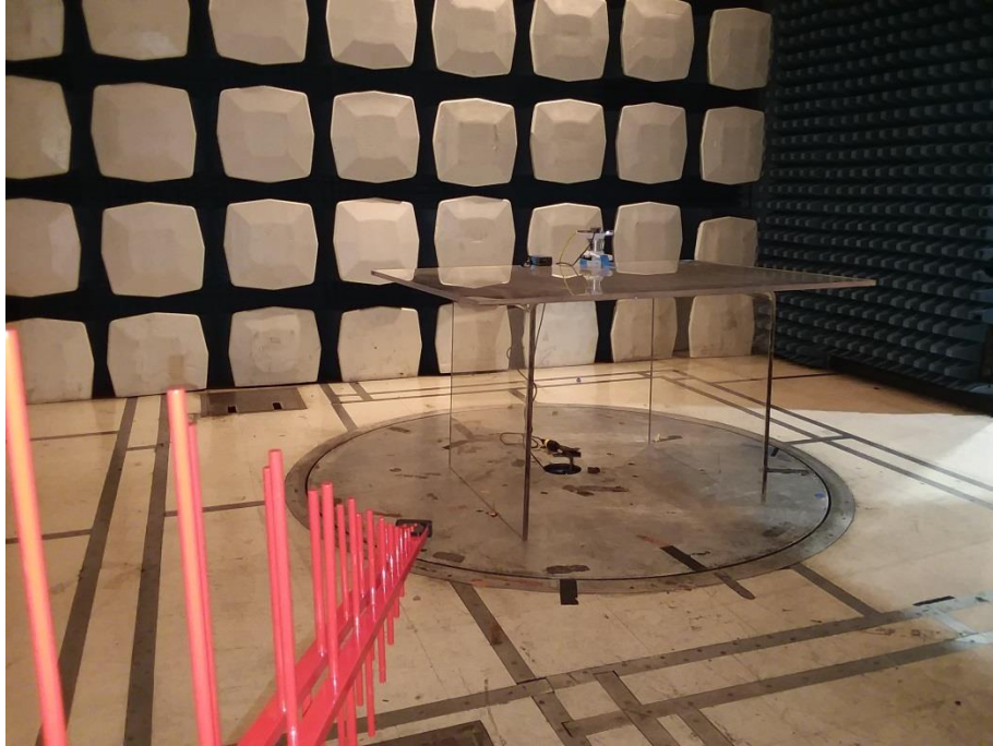
Photograph 1. Radiated Spurious Emissions, Test Setup, 30 MHz – 1 GHz